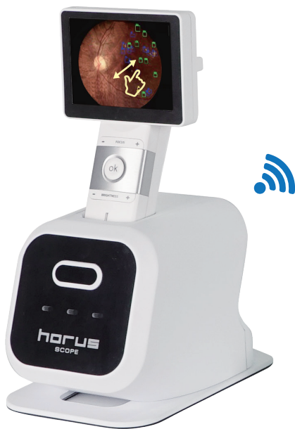
DSC 300 + DIB 100